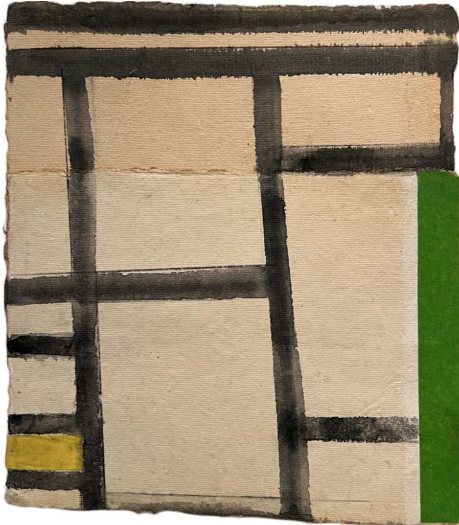
Dan Rizzie, Flounders #3 , 2024, 9 x 8 inches

Long time “Dallas favorite son”, Dan Rizzie, will be represented by three new collage / watercolors as well as a 1982 large scale chine colle print and a mixed media painting from 1984.