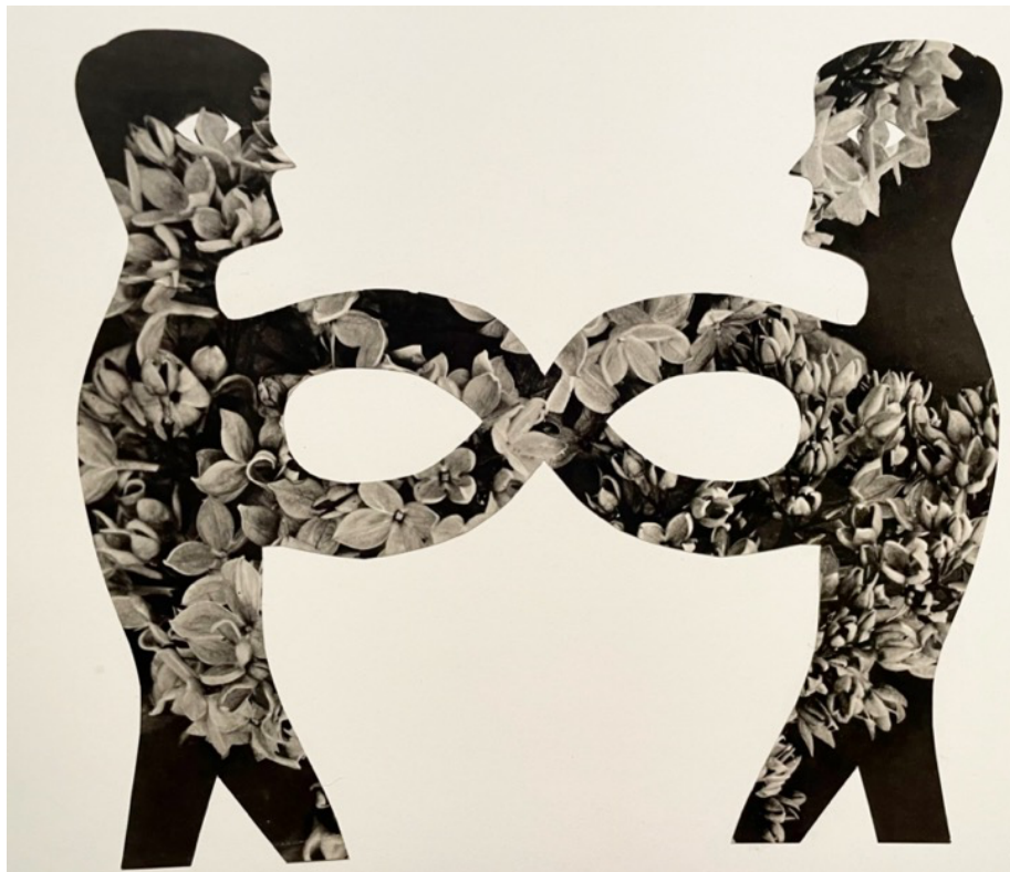
Jessica Sinks, Hug, 2019, Collage on paper, 11 x 14 inches