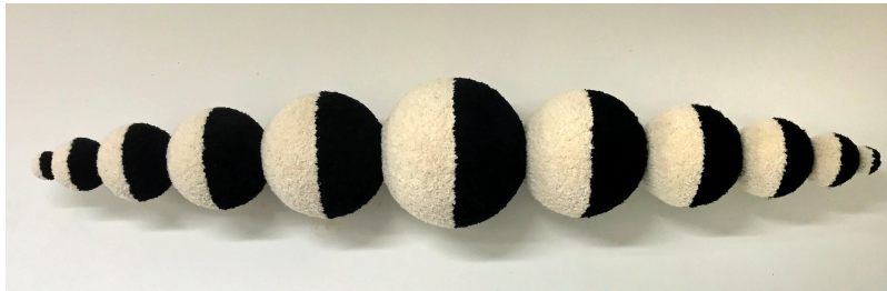
LINNEA GLATT Tangents Aligned, 2018 Fabric 12 x 72 x 12 inches

Glatt continues to explore the idea of progression, sequence, and order through a sculptural application. These latest works considers patterns, whether that is through inverting, reversing, opposing, and comparing components.