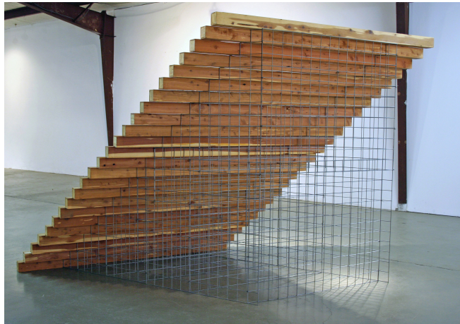
TOM ORR STAIRS, 2011 Wood and steel 96 x 120 x 96 inches

STAIRS comes from Orr's reoccurring interest in common elements of architecture taken out of context. By isolating a familiar architectural element, such as a set of stairs, and changing its scale and perspective, it transforms into a stand-alone sculpture.