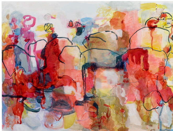
TERRELL JAMES Retinue, 2017 Acrylic and Oil on canvas 78 x 105 inches

Terrell James's large painting Retinue evokes both human form and landscape. Inspired by sources as diverse as Degas bathers, Japanese landscape scrolls, and Inuit women's land paintings from the 1990's, James suggests bent torsos, distant hills, smooth boulders throw off intense colors. Congregating reds, pinks and yellows are pushed back by tonal shifts in early ochre washes and blue violet shadows. Though these masses suggest weight, they also seem to float.