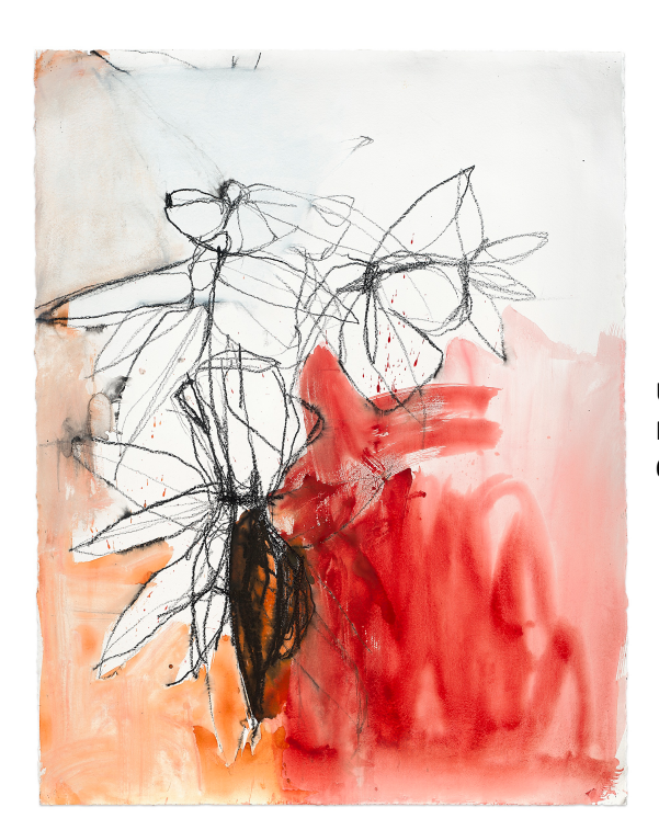
Untitled 42.18, 2018 Mixed media on paper 66 x 52 inches

This exhibition will mark Andrea Rosenberg's fourth solo showing of large-scale works since 2008. Her work is comprised mostly of oil, gesso, acrylic, watercolor, graphite, and crayon on paper; however the largest work in the exhibition will be a painting using the same materials on linen.