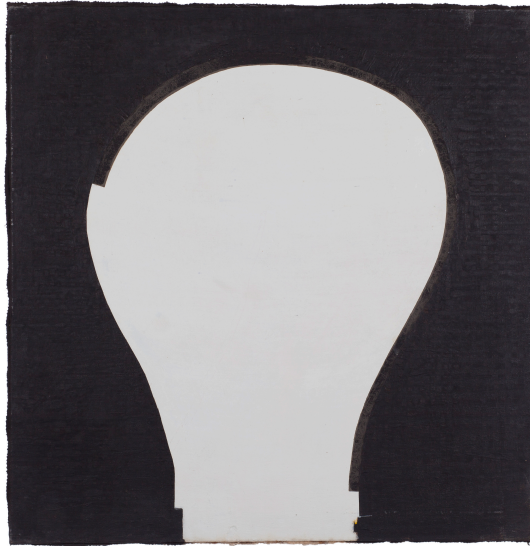
John Wilcox Light Question, 1983 Acrylic on canvas 30 x 29 1/2 x 1 1/2 inches