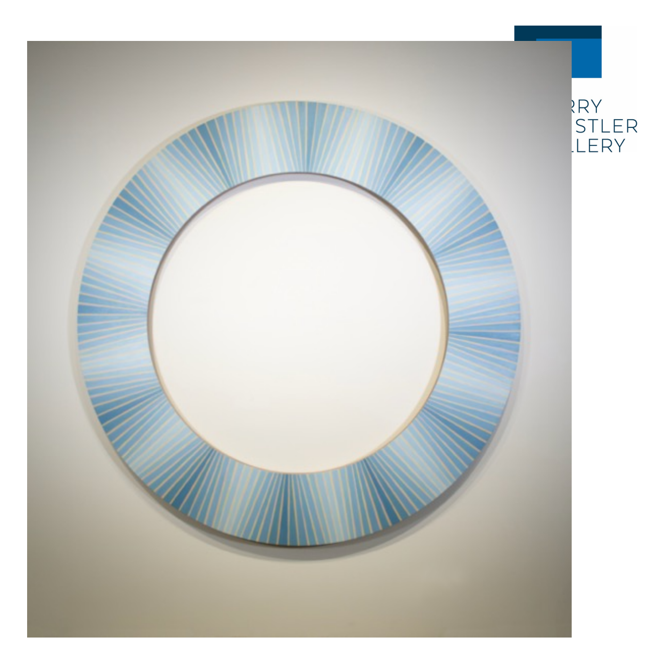
Jay Shinn Blue Noon, 2023 Acrylic on birch panel 80 x 80 x 1 ½ in